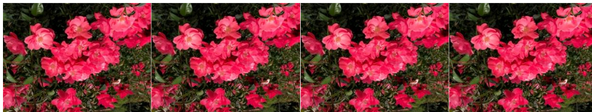
Banner photo: Bon Air Memorial Rose Garden

The newsletter of the Rock Spring Garden Club, Arlington, VA www.rockspringgardenclub.com