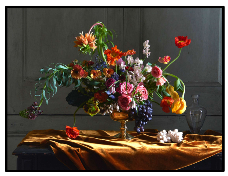
Featuring Exquisite Designs by