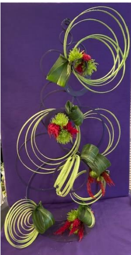
Julia Clevett's cascade and abstract creative floral designs made for the Judges' Symposium held in late September 2022.