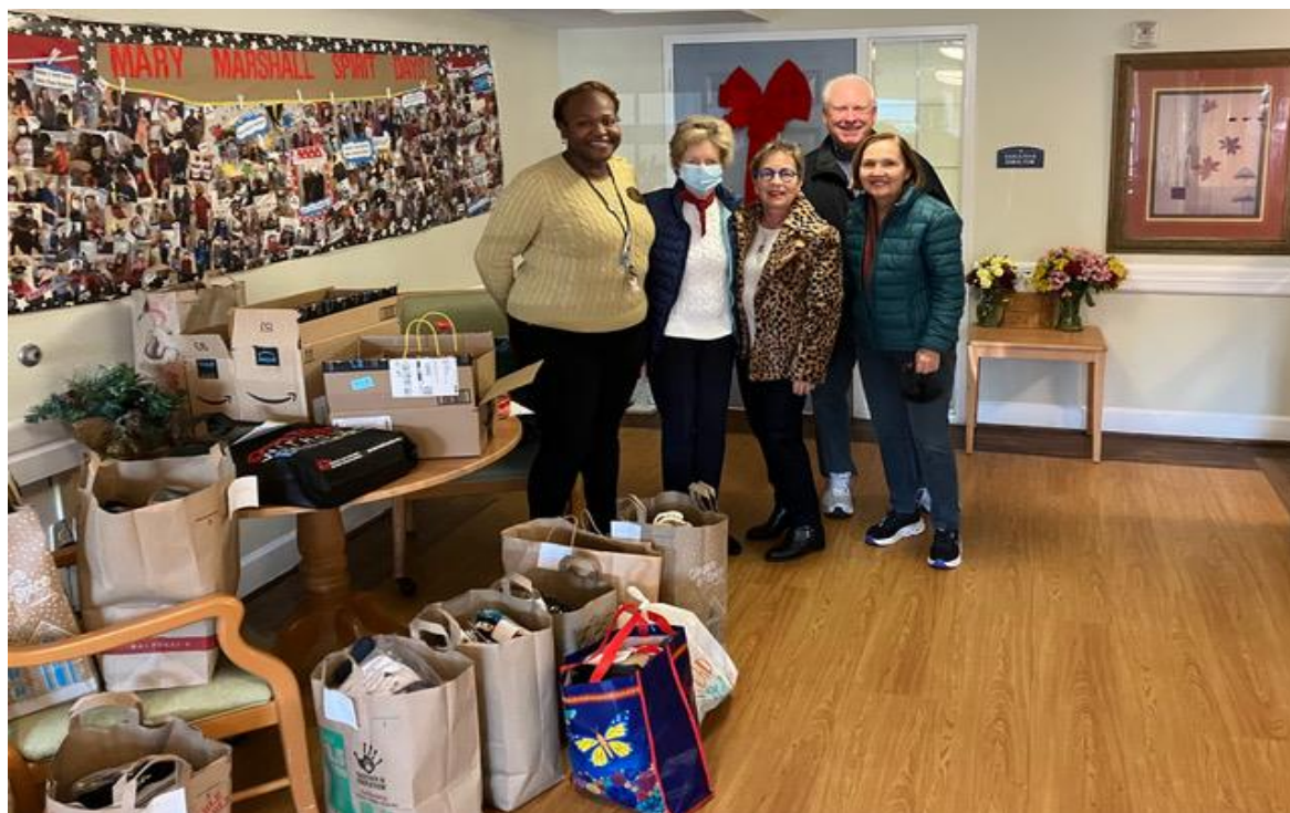
Last year's gift delivery at Mary Marshall

https://www.amazon.com/VO5-Mens-Shampoo-Conditioner-Fresh-Energy/dp/B00K0IJMWY/ref=sr_1_2?crid=12AE1LKQXEVBA&keywords=combination+product%3A+shampoo%2C+conditioner+and+body+wash&qid=1701291459&srefix=combination+product+shampoo%2C+conditioner+and+body+wash%2Caps%2C72&sr=8-2