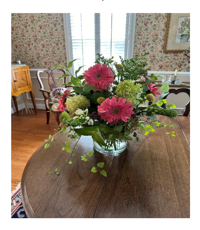
Renee Bayes late blooming clematis