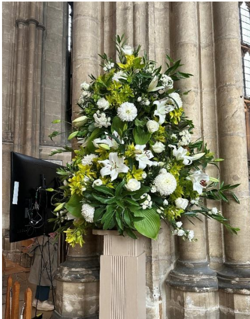
Canterbury Cathedral, England