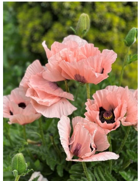
Poppies at Belfast Castle, Ireland