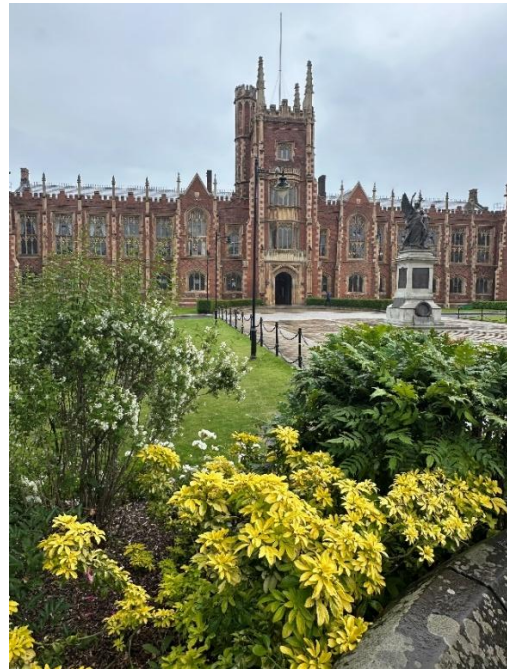
Queen's University, Belfast