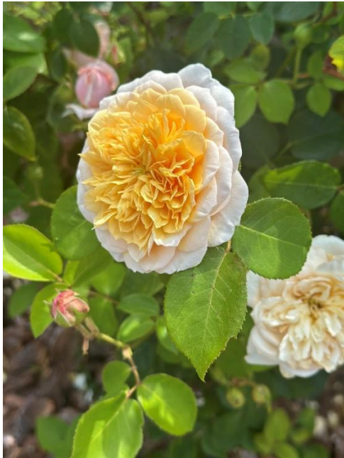
Greenwich Park, England