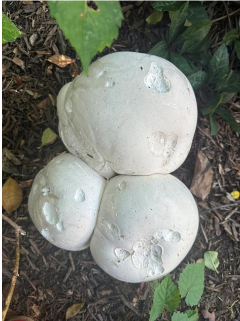
Giant Puffball Mushrooms