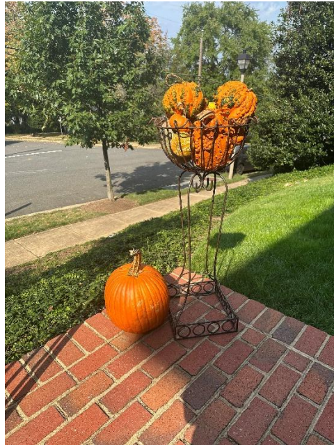
and Giant Pumpkins