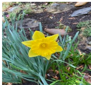
Springtime in Arlington